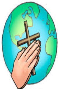
World Mission Sunday

Today is World Mission Sunday. We join Catholics around the globe in supporting the mission of the Church in places where the faith is young, growing, or facing particular challenges. Your generous contributions today will make a significant impact on the lives of many and help spread the Gospel message to all corners of the world. Thank you for your prayers and support.