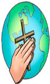
World Mission Sunday

On behalf of the Pontifical Mission Societies, we extend our heartfelt gratitude for your generous support on World Mission Sunday. Your contributions will help sustain the Church's missionary work and bring the light of Christ to those who need it most. Let us continue to pray for our missionaries and people they serve, and may we always be mindful of our call to be missionaries in our own lives. Thank you!